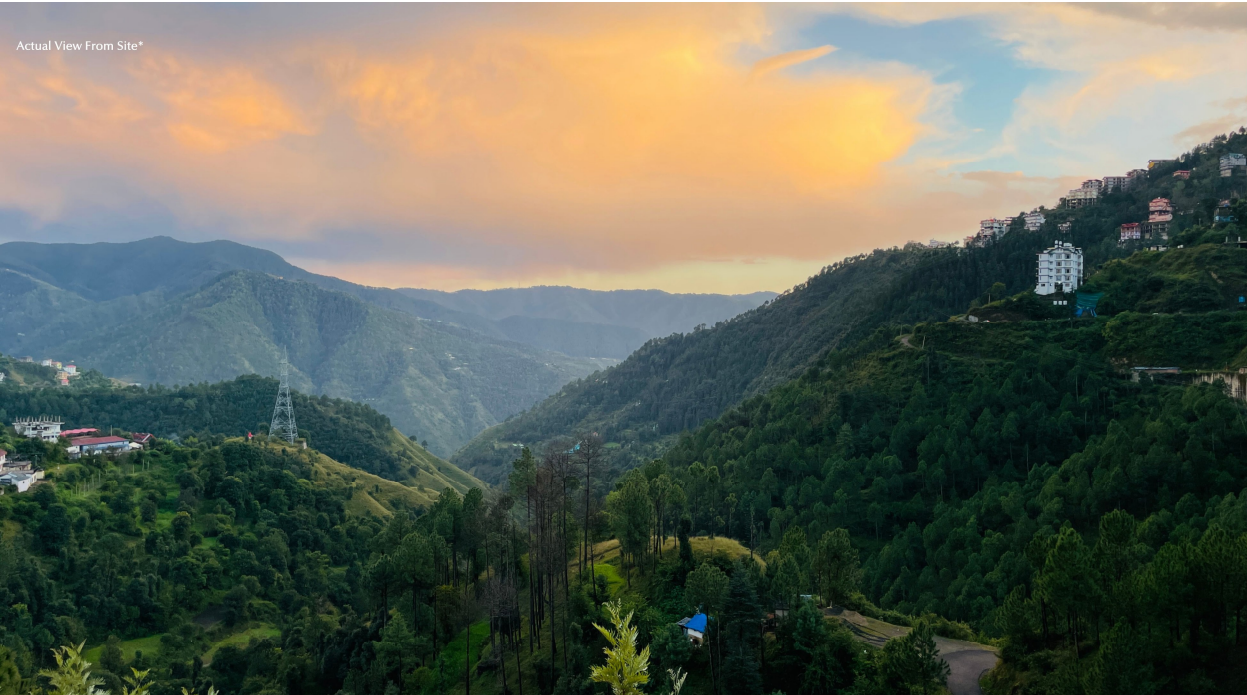
Actual View From Site*