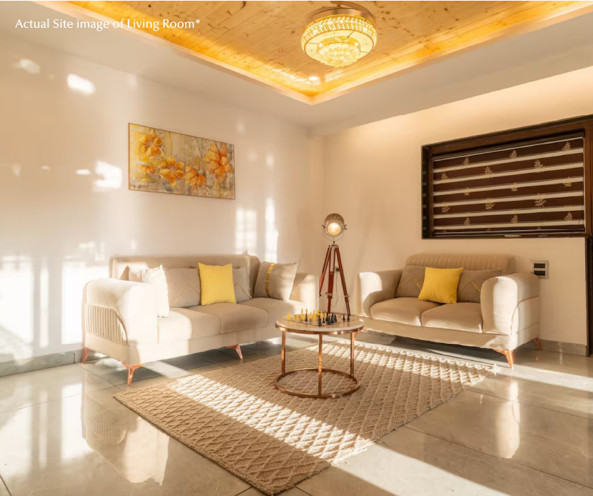
Actual Site image of Living Room*