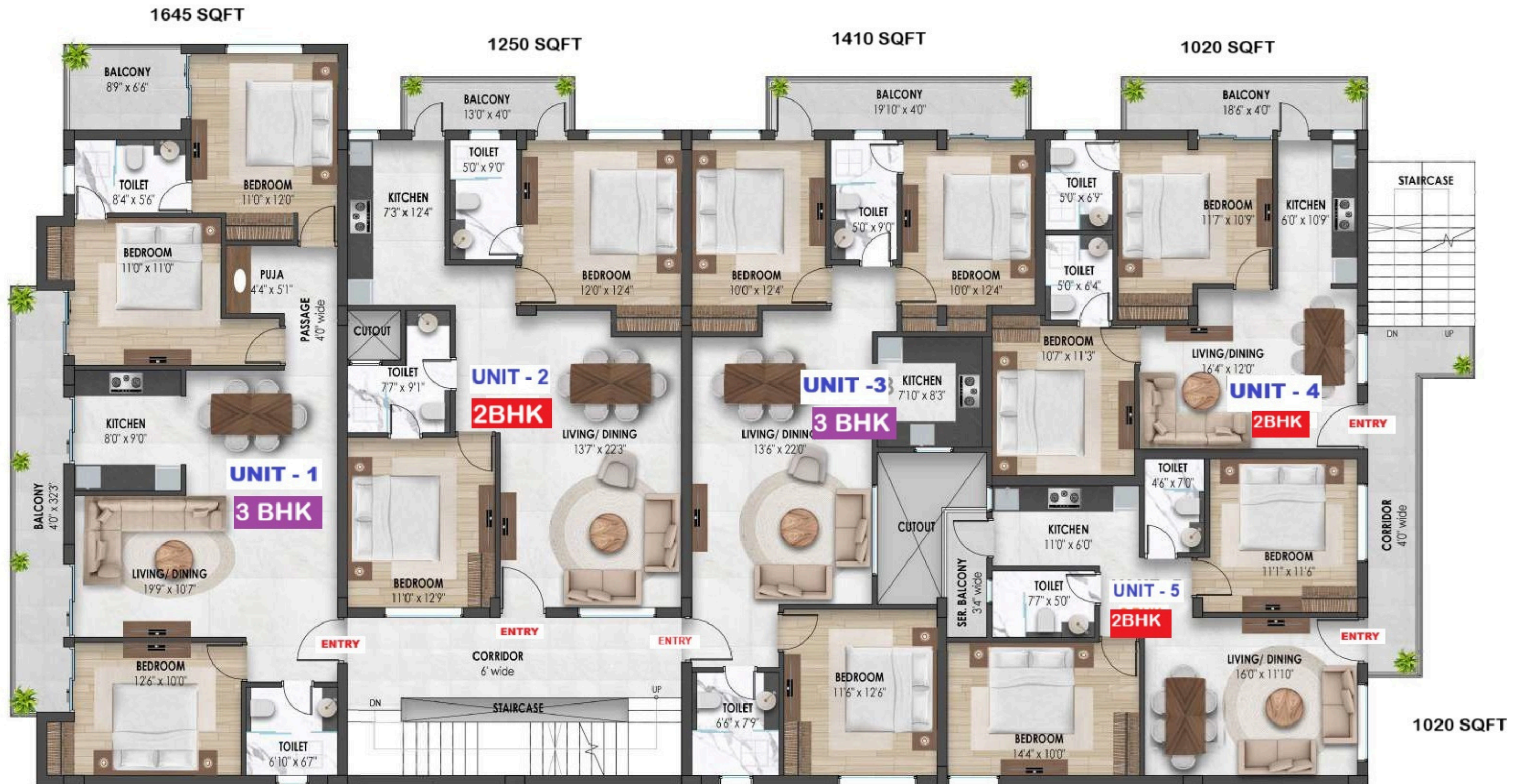
BLOCK - F THIRD & FOURTH FLOOR