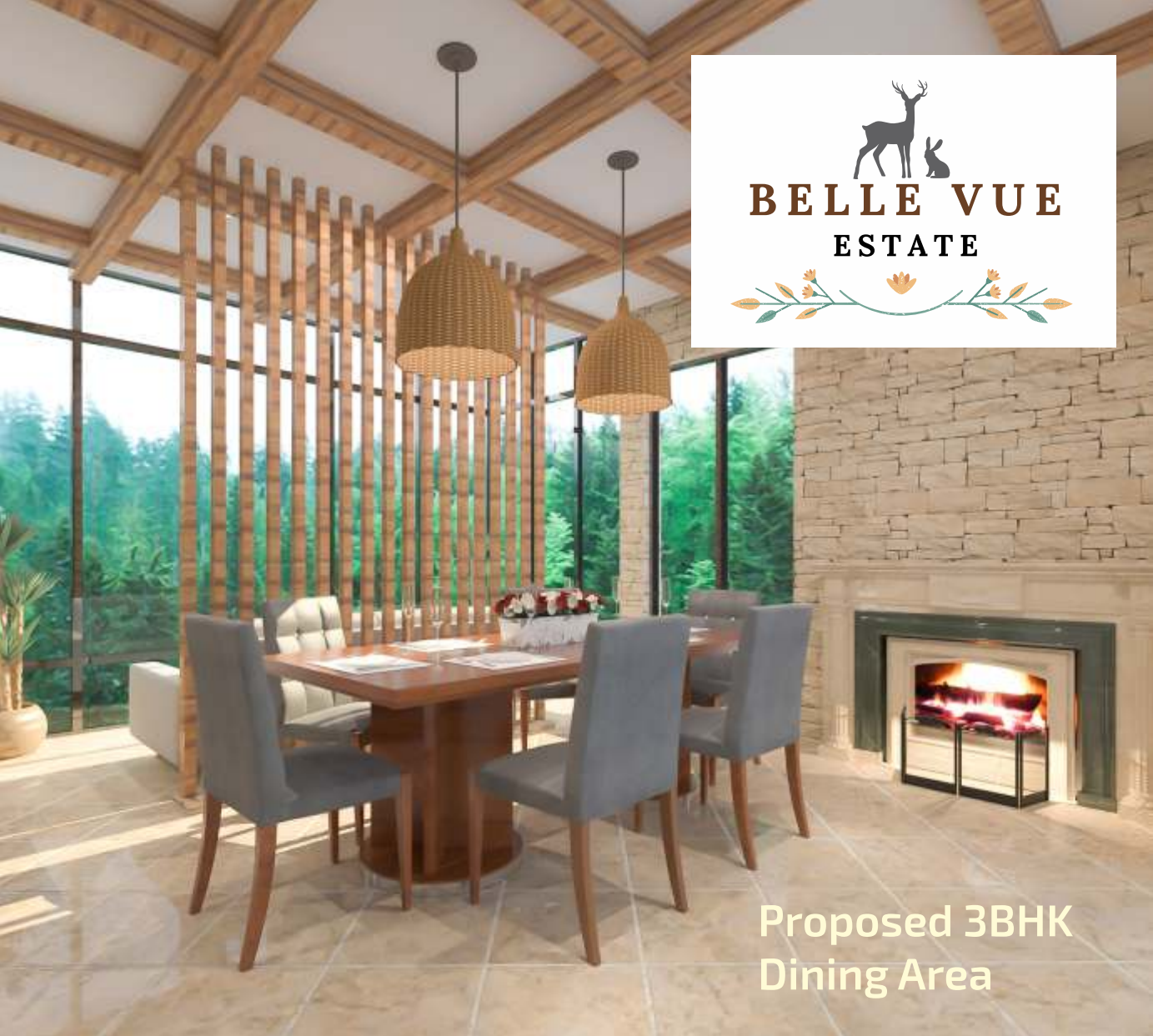
Proposed 3BHK Dining Area