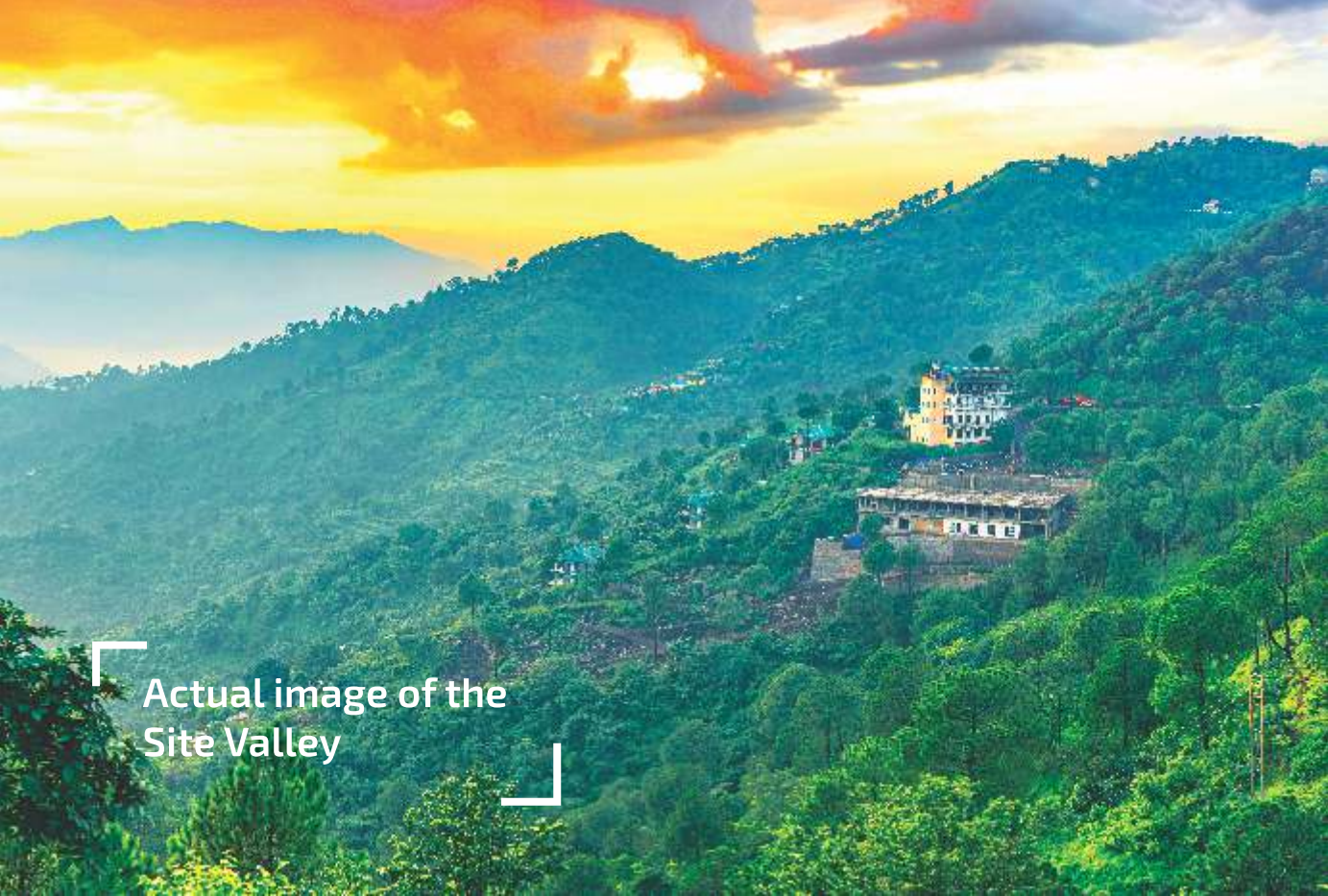
Actual image of the Site Valley