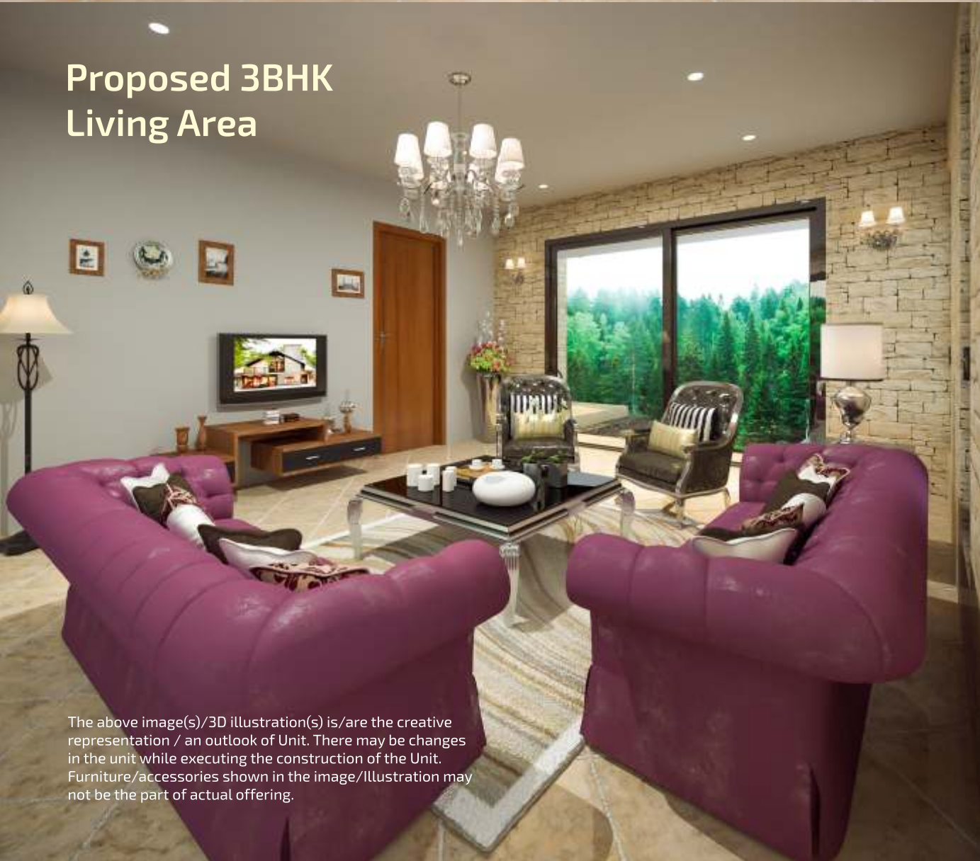
Proposed 3BHK Living Area

The above image(s)/3D illustration(s) is/are the creative representation / an outlook of Unit. There may be changes in the unit while executing the construction of the Unit. Furniture/accessories shown in the image/Illustration may not be the part of actual offering.