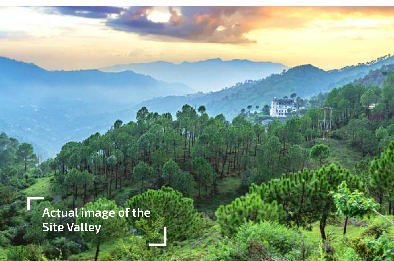
Actual image of the Site Valley