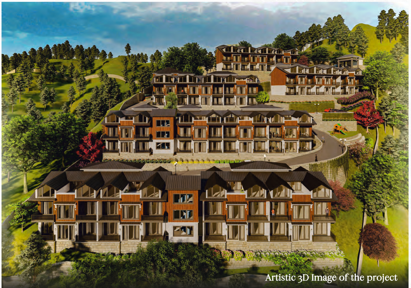
Artistic 3D Image of the project

Taradevi's Enclave Phase 1 brings luxury living to Shimla, a hill station famous for its verdant scenery, magnificent mountains and old-world charm with colonial era architectural landmarks. The project, perched at 1800 meter above sea level, is located in New Shimla, the most premium location of Shimla. Spread over 5213 sq meter, phase 1 provides an exclusive inventory of 37 residential units comprising 2BHK units and duplex penthouses.