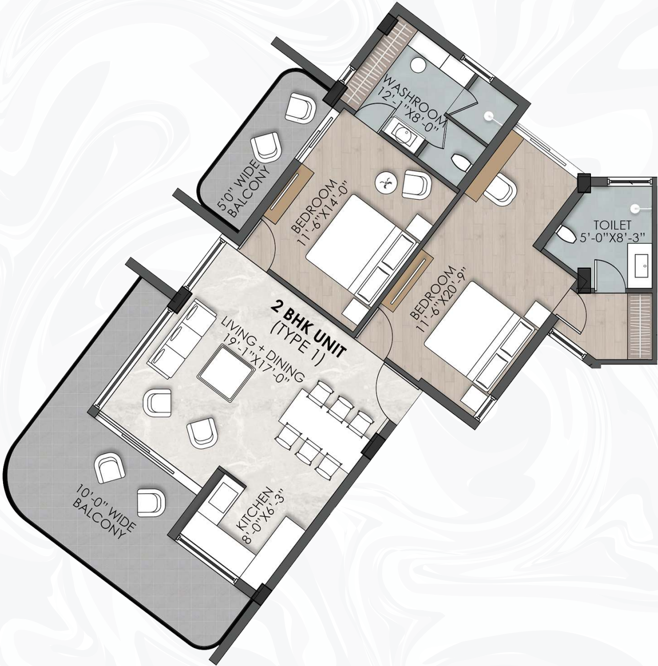
2 BHK UNIT TYPE 1 TYPICAL FLOOR PLAN