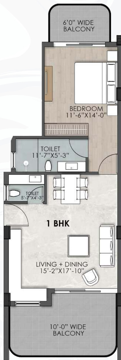
1 BHK UNIT TYPICAL FLOOR PLAN