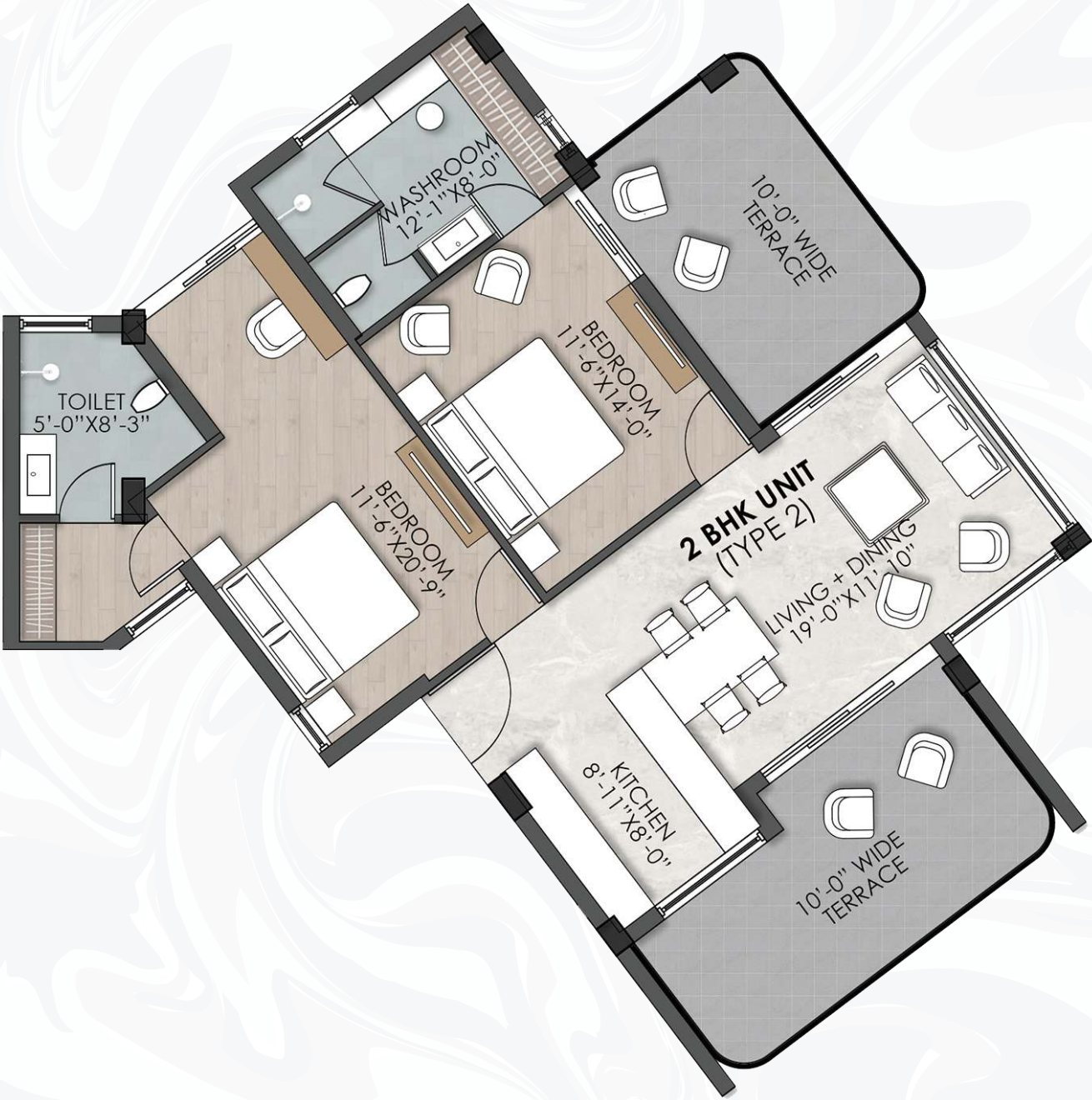
2 BHK UNIT TYPE 2 TYPICAL FLOOR PLAN