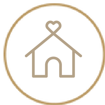
Rental Management Services